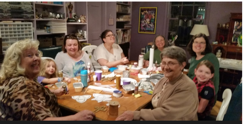
Decorating Chrismon Ornaments

Circle of Friendship meets on the second Tuesday of each month at 6:30 p.m. in a