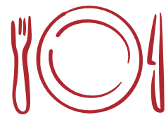
Meals for Missions

Cooks Needed! If you can contribute to this worthy cause by preparing and freezing a meal, please sign up at chambleeumc.org/M4M-prepare . All disposable bakeware and recipes will be provided. Prepped meals must be delivered to the church by Jan 24.