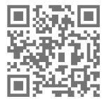
Scan to Give

An offering is collected to support the work of Chamblee Methodist, sharing God's love with the world. Whether you are a church member, a regular worshiper, or an active participant in one of our ministries, your gifts are valued and appreciated. For those who prefer to contribute electronically, you may text the word CHAMBLEE to 73256 using your mobile device OR give securely any time at chambleeumc.org/give