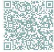
Wed Nite Supper