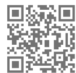
Scan to Give

An offering is collected to support the work of Chamblee Methodist, sharing God's love with the world. Whether you are a church member, a regular worshiper, or an active participant in one of our ministries, your gifts are valued and appreciated. For those who prefer to contribute electronically, you may text the word CHAMBLEE to 73256 using your mobile device OR give securely any time at chambleeumc.org/give