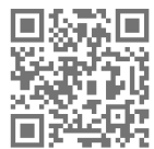
Scan to Give

An offering is collected to support the work of Chamblee Methodist, sharing God's love with the world. Whether you are a church member, a regular worshiper, or an active participant in one of our ministries, your gifts are valued and appreciated. For those who prefer to contribute electronically, you may text the word CHAMBLEE to 73256 using your mobile device OR give securely any time at chambleeumc.org/give