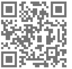
Scan to Give

An offering is collected to support the work of Chamblee Methodist, sharing God's love with the world. Whether you are a church member, a regular worshiper, or an active participant in one of our ministries, your gifts are valued and appreciated. For those who prefer to contribute electronically, you may text the word CHAMBLEE to 73256 using your mobile device OR give securely any time at chambleeumc.org/give