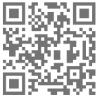
Scan to Give

An offering is collected to support the work of Chamblee Methodist, sharing God's love with the world. Whether you are a church member, a regular worshiper, or an active participant in one of our ministries, your gifts are valued and appreciated. For those who prefer to contribute electronically, you may text the word CHAMBLEE to 73256 using your mobile device OR give securely any time at chambleeumc.org/give