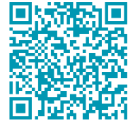
Worship Identity Survey

Please take the time to share your thoughts and provide feedback as we strive to discern and clarify our worship identity as a church. Please check your email for a link to this important survey or scan the QR code to access. Paper copies are also available in the Narthex and Atrium. For every survey completed, we will donate $2 towards the purchase of back-to-school supplies for Huntley Hills.