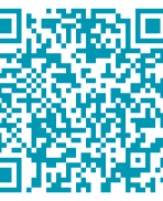
Worship Identity Survey

Please take the time to share your thoughts and provide feedback as we strive to discern and clarify our worship identity as a church. Please check your email for a link to this important survey or scan the QR code to access. Paper copies are also available in the Narthex and Atrium. For every survey completed, we will donate $2 towards the purchase of back-to-school supplies for Huntley Hills.