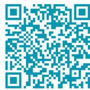
Worship Identity Survey

Please take the time to share your thoughts and provide feedback as we strive to discern and clarify our worship identity as a church. Please check your email for a link to this important survey or scan the QR code to access. Paper copies are also available in the Narthex and Atrium. For every survey completed, we will donate $2 towards the purchase of back-to-school supplies for Huntley Hills.