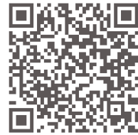
Financial Update as of 8/31/24

Scan this QR code to access an important State-of-the-Church message emailed on 9/13/24 from the Chip Zint and the Finance Committee